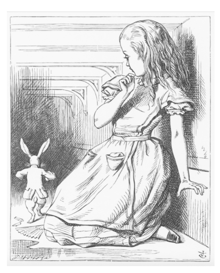
But he is often in a massive rush – he 'hurries' and 'scurries' all over the place. He is very flustered and fearful and nervous. You can see it a bit more in this picture.

Copy that style of running and see how that adds to his character. But we only see him from behind. What kind of facial expression would he have as he runs?