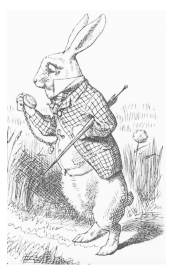
The White Rabbit doesn't look in much of a hurry here!